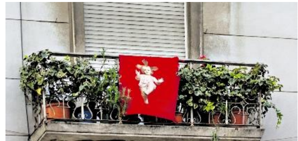
Christmas decorations are put up everywhere at Christmas Time in Portugal.

FRS Portugal hosted a quiet Christmas dinner with all its employees in a restaurant in Lisbon at the end of November. It will also pause its operations as of 24 th December to enable employees to celebrate Christmas with their families and resume them on 26 th .