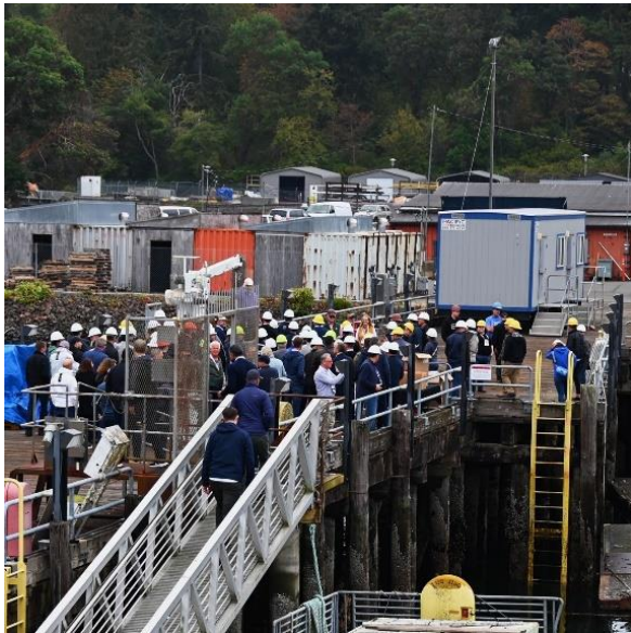
Participants at one of the activities throughout the conference

Ferries' Colman Dock. The tour also included a walking tour of the maintenance facility of Washington State Ferries. And with the end of this tour, the conference was brought to a finale.