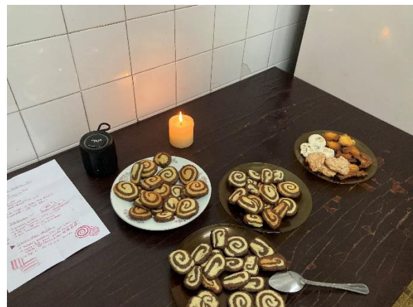
Baking Christmas cookies is popular in Germany.

Unfortunately, it is impossible to gather all FWOL's employees and crew to celebrate, but as many as possible were able to come together on 15 th December in Sassnitz to have a meal.