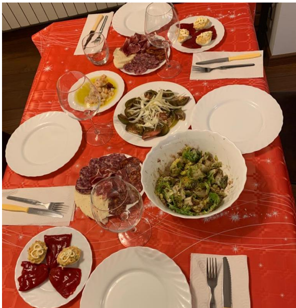
Spanish Christmas dinners can be almost anything – as long as it is delicious.

All offices will be decorated in a Christmassy manner, and HR will offer all employees the opportunity to participate in the National Christmas Lottery. A present will also be given to every employee, and before the pandemic FRS Iberia also organized a meeting with the Reyes Magos (the Three Kings) in the HQ in Tarifa for employees with small children. The Three Kings bring the presents, and not - as in Germany - the Christ Child or Father Christmas on Christmas Eve. The day is all about spending time as a family and having good food. Typical dishes usually include meat or seafood and dessert: the almighty roscón.