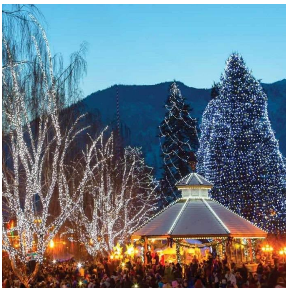
At Christmas, decorations are put up everywhere.