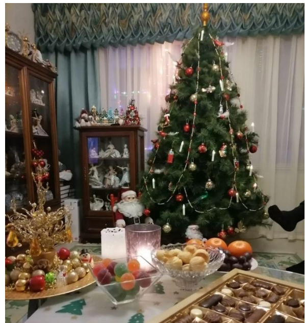
A trimmed Christmas tree and lots of sweet goodies make Christmas right in Finland.