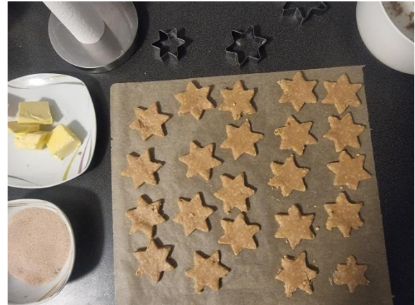
Cookies ready to be baked.

To finalize this issue, a member of the Editorial Department shared his secret cookie recipe for Christmas. This year you can bake the perfect cookie by following this recipe.