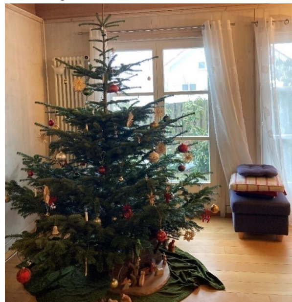
Christmas trees in Germany are trimmed on Christmas Eve.

Having a real Christmas tree is very important in Denmark – so much so that, in fact, there is a train shuttle service from Copenhagen which takes tree-choppers out into the forest and brings them and their trees back home.