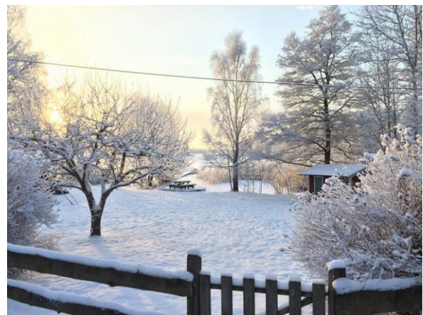
Christmas in Sweden is a winter wonderland!