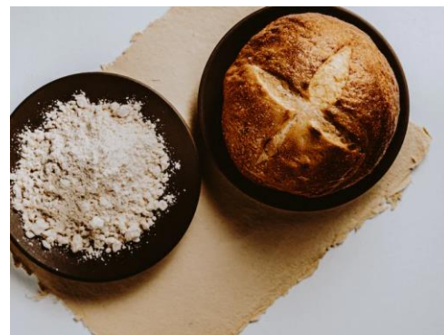
Finnish Rye Bread

the name of the Finnish rye bread made from sourdough. It is a must for the Finns for breakfast and a must for tourists to try it while staying in Finland. If you are a cheese lover, Leipäjuusto is what you need. This Finnish cheese is a typical side dish in Finland and the best part is that you do not need bread or anything to accompany it, only cloudberry marmalade, because the cheese itself is considered a type of bread due to its consistency. And lastly, the Lohikeitto, a typical creamy salmon soup. The soups descriptions already reveal what it tastes like, therefore you can have it in a cold day and warm your body after a long day touring.